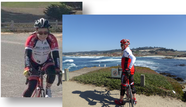
October - finally back on bikes in Pacific Grove