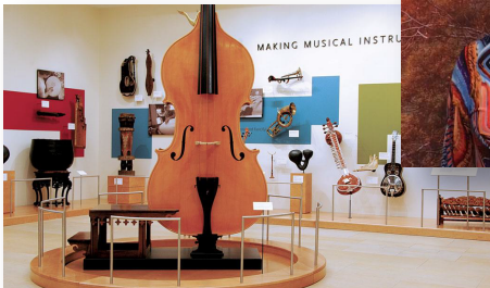
Visiting MIM, Musical Instrument Museum in Phoenix, was a highlight.