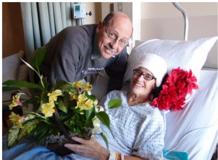
The smiling healing patient!