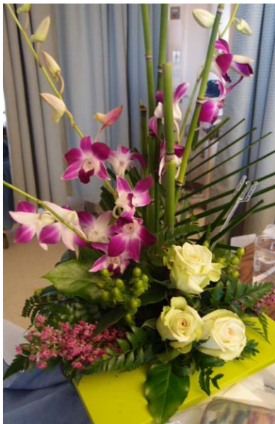
Lots of beautiful flowers!